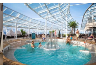
Pool and Sports Zone