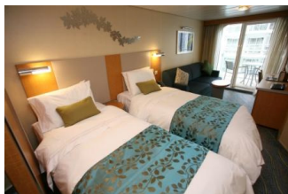
Central Park Balcony