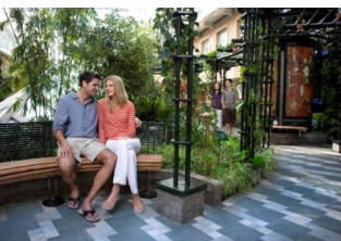
Central Park SM